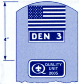
TIGER CUB, CUB SCOUT OR WEBELOS SCOUT RIGHT SLEEVE