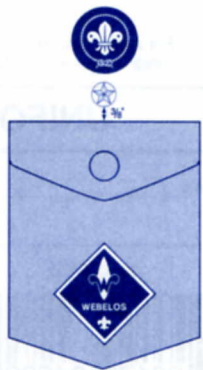
WEBELOS SCOUT LEFT POCKET (BLUE OR TAN SHIRT)

Conduct uniform inspections with common sense; the basic rule is neatness.