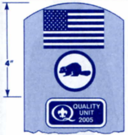
WEBELOS SCOUT RIGHT SLEEVE